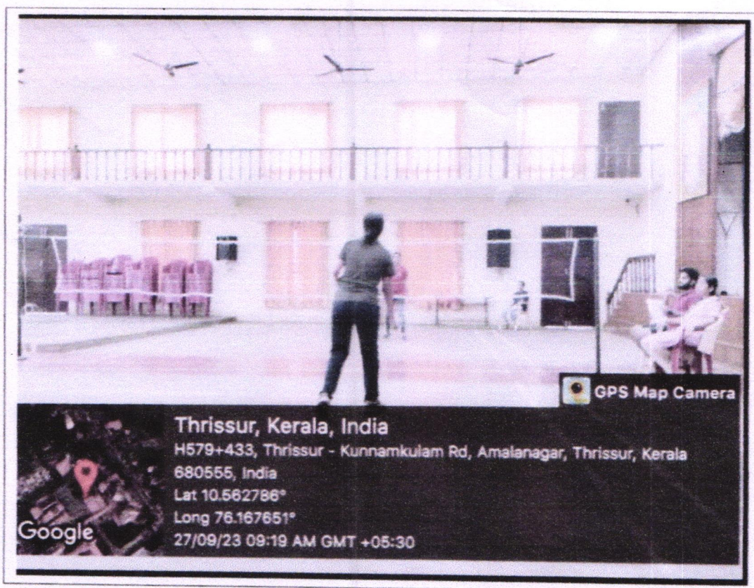
ACON, INDOOR GAME CORT

Affiliated to Kerala University of Health Sciences and recognized by Kerala Nurses and Midwives Council & Indian Nursing Council (Certificate No. 18-16/2893-INC)